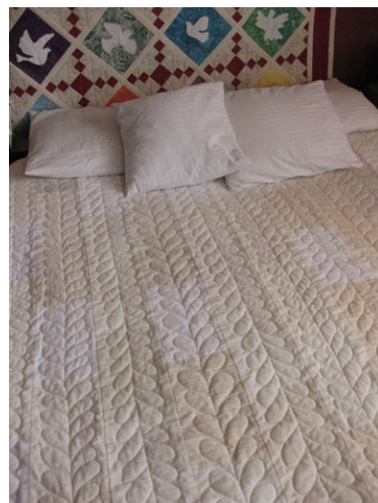
Samples of finished quilts